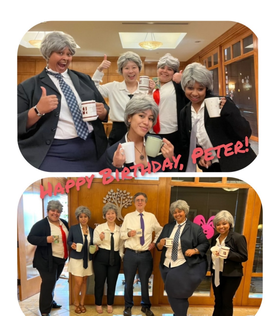
Here's to another year around the sun and to many more!

Have You Voted for South Bay's 2022 Bests?