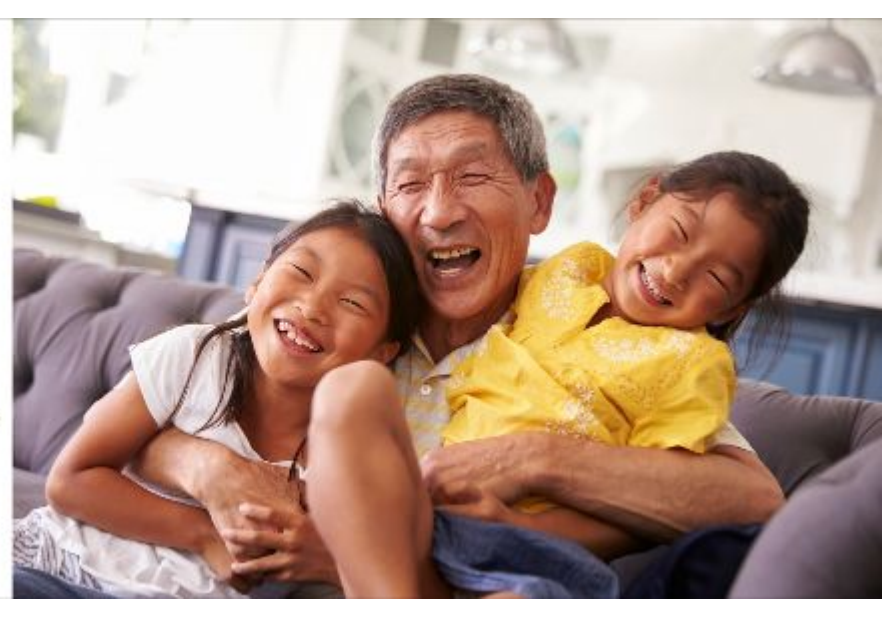
FEBRUARY 2023 ISSUE

Our Firm | Resources | Seminars | FAQs | Contact Us