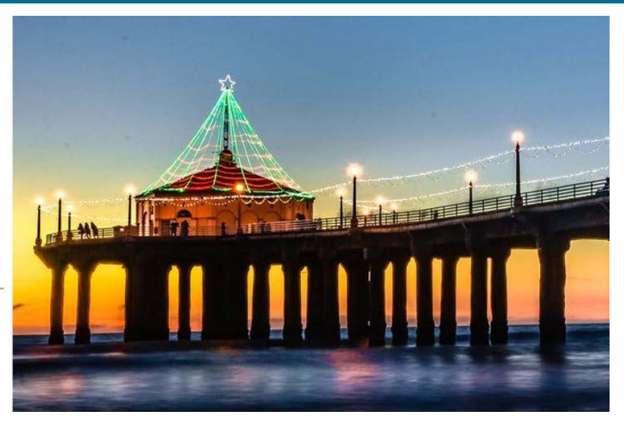
DECEMBER 2020 ISSUE

Our Firm | Resources | Seminars | FAQs | Contact Us